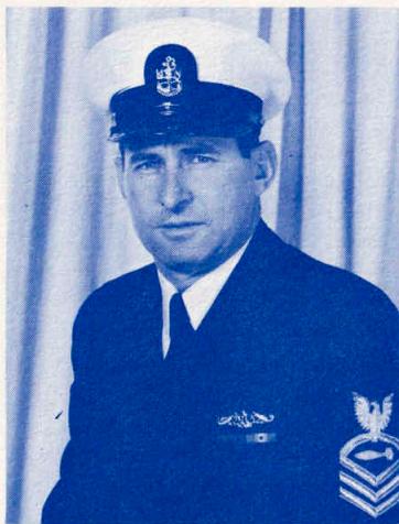
Chief of the Boat